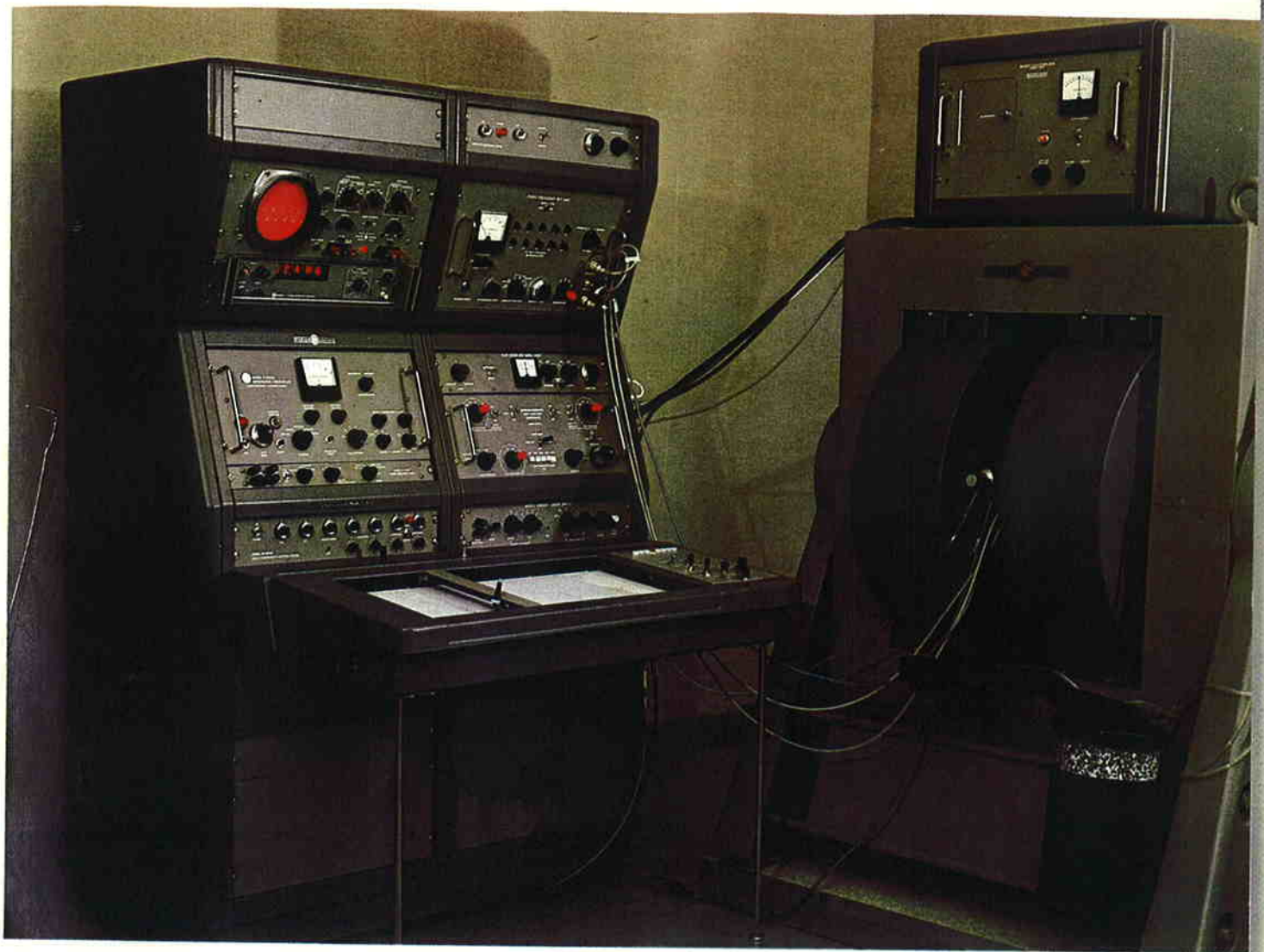
High Resolution NMR Spectrometer (Varian HA 100 D)